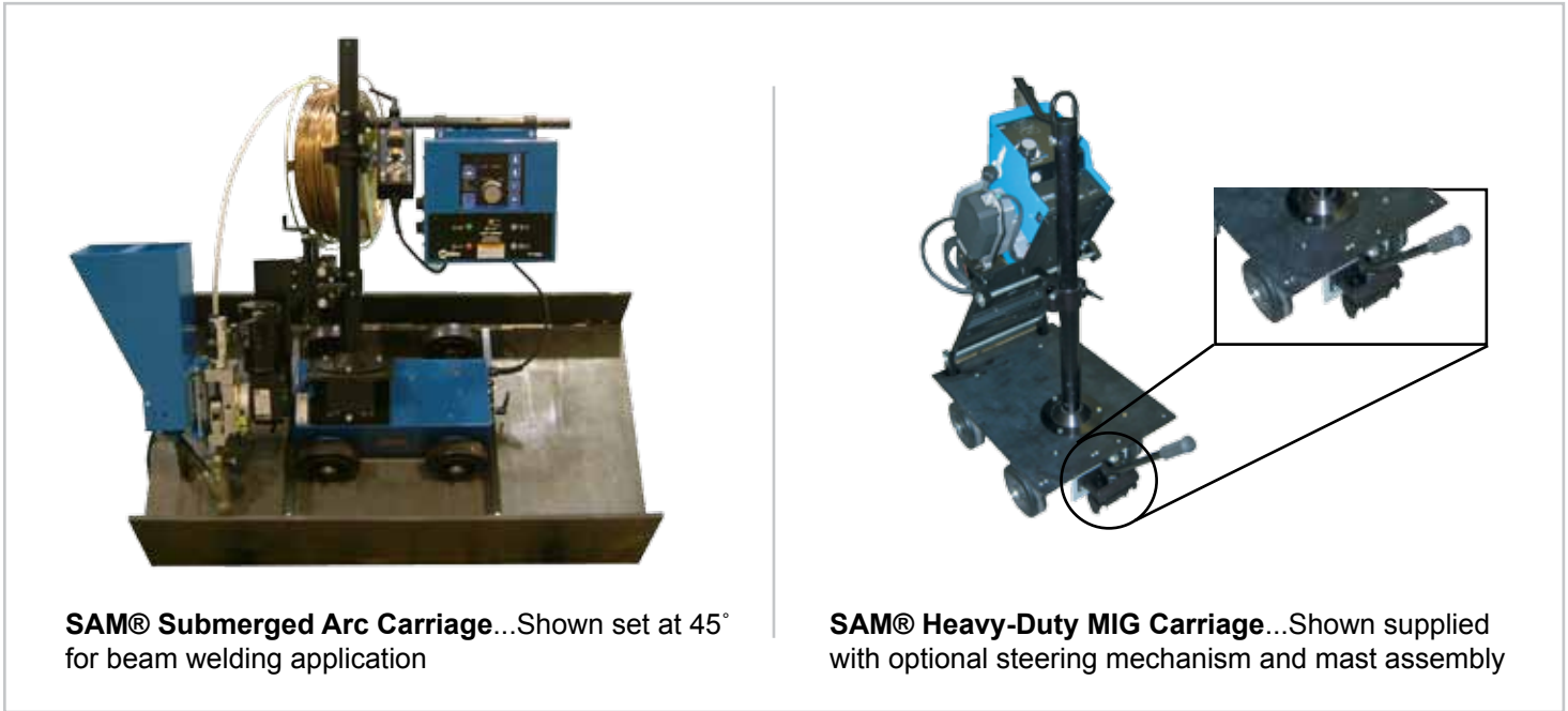
SAM® Submerged Arc Carriage ...Shown set at 45° for beam welding application

The carriage specifications are the same as that of the GM-02-295, but provided with 17" x 22" (43.18 x 55.89 cm) aluminum plate providing full flat mounting surface for customer's supplied wire feeder.