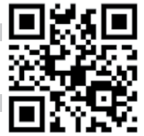
PLATE BEVELLING MACHINE - HEAVY DUTY KBM-28®