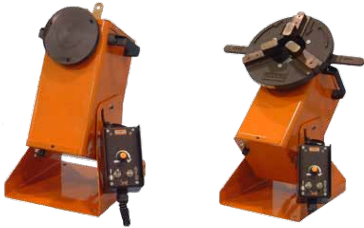
Table on the Gullco Model GP/GPP-200 Series of Welding Positioners (above left) is designed for mounting the WPG-250 Welding Gripper as indicated.

Horizontal 0.27 to 4.63 rpm rotation and 0.75 to 12.5 rpm in the "H" model Table tilts any angle 0 - 90°